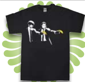
Banksy Pulp Fiction Bananas tee, £14 from www.8ball.co.uk