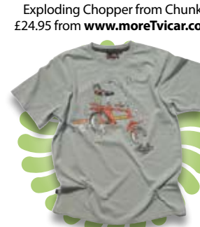
Exploding Chopper from Chunk, £24.95 from www.moreTvicar.com