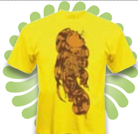
Fat Punk Eve t-shirt, £29.99 from www.fatpunkstudio.com