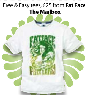
Free & Easy tees, £25 from Fat Face, The Mailbox