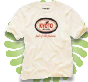
Jacamo White Petrol logo T-Shirt, £10