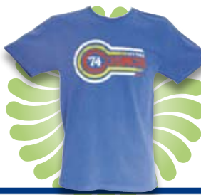
Jakes vintage Cosmos '74, £28 from www.moreTvicar.com