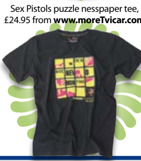
Sex Pistols puzzle newspaper tee, £24.95 from www.moreTvicar.com