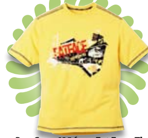
Pop Crew £25 from Fat Face, The Mailbox