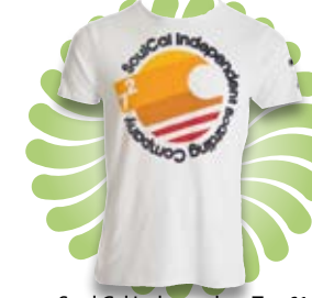
Soul Cal Independent Tee £16.99, from Republic