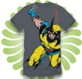
Angle Wolverine tee, £25 from French Connection

Wearing a design or slogan that makes you stand out is one of the key attractions, and this summer there's another raft to choose from, whatever your size, taste, budget or gender. Here are just a few that caught our eye: