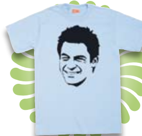
McNulty from The Wire, £12 at www.shotdeadinthehead.com