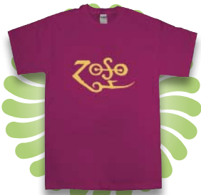
Led Zeppelin Coda T-shirt, £14.99 from www.8ball.co.uk